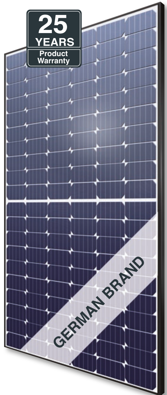
Fig. similar 120MHAUS220818A

*Subject to the terms and conditions contained in the applicable AXITEC Energy Australia Pty Ltd Warranty Statement. This 25-year limited product warranty is only available for residential rooftop installations within Australia with a maximum capacity of 40 kWp.