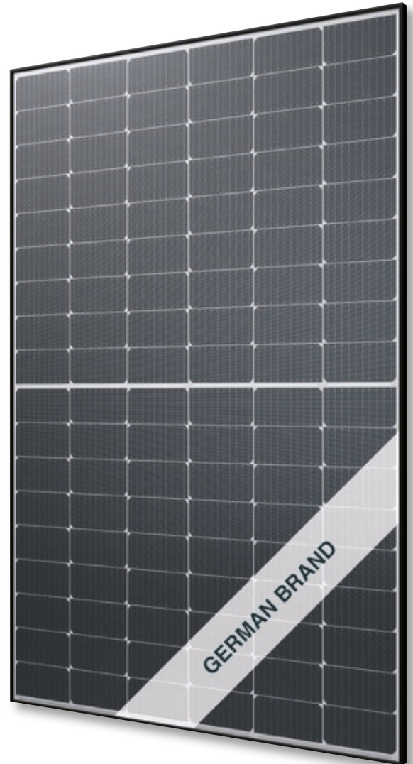
Fig. similar 08MIHEN230801A