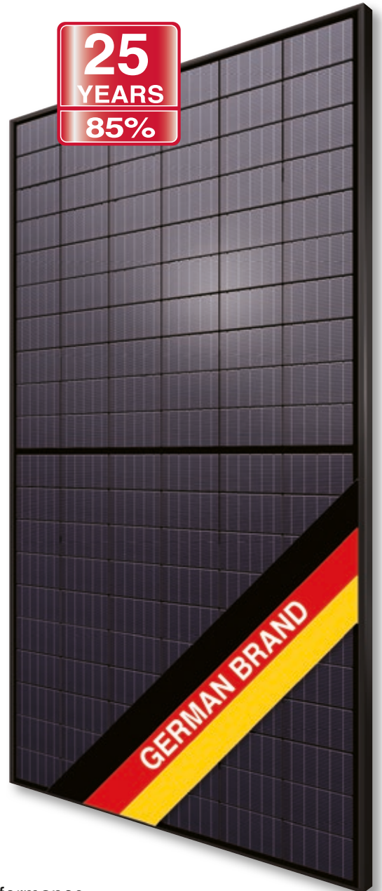
Fig. similar 120MHIN200629A

Exclusive linear AXITEC high performance guarantee!