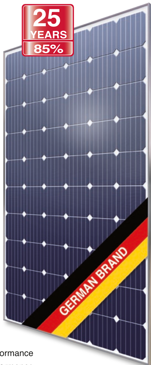
Fig. similar 60MIN191030A