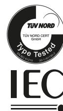
Fig. similar 60PIN200109A