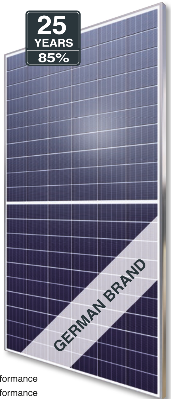
Fig. similar 120MHEN201027A

Exclusive linear AXITEC high performance guarantee!