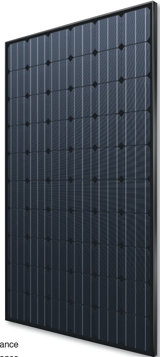
Fig. similar 60M156USA160531A

IP 67 High quality junction box and connector system for a longer life time