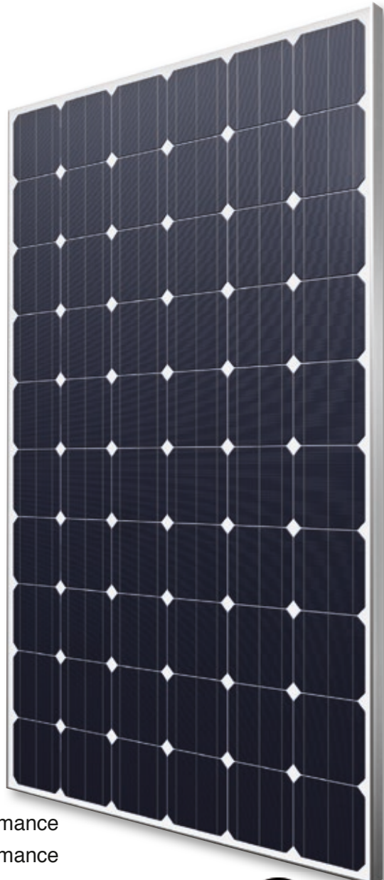
Fig. similar 60M156USA180111A

IP 67 High quality junction box and connector system for a longer life time