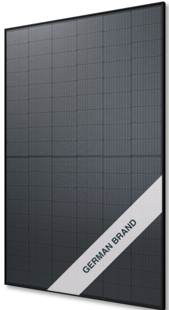
Fig. similar 08MIHEN21103A