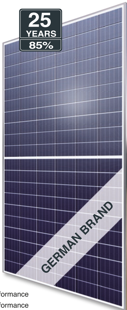
Fig. similar 120MH-IN201117A

Exclusive linear AXITEC high performance guarantee!